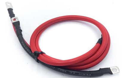
Upgraded battery cable supplied